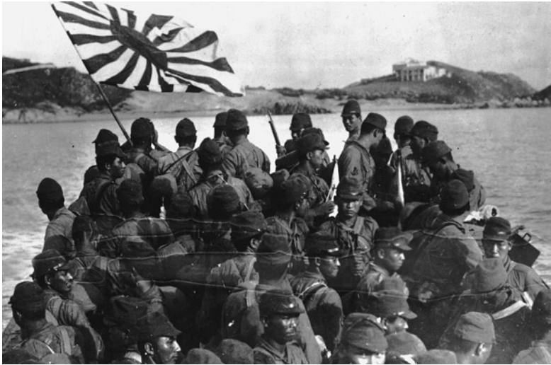
▲ A Japanese landing party approaches the Chinese mainland. The invasion forced Mao and Jiang to join forces to fight the Japanese.

Communist Party leaders realized that they faced defeat. In a daring move, 100,000 Communist forces fled. They began a hazardous, 6,000-mile-long journey called the Long March . Between 1934 and 1935, the Communists kept only a step ahead of Jiang's forces. Thousands died from hunger, cold, exposure, and battle wounds.